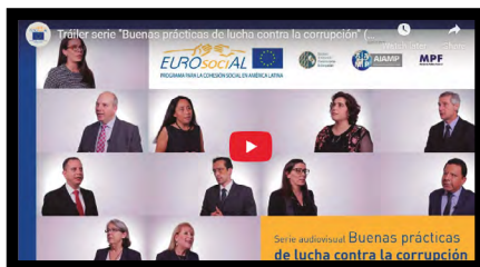
Audio-visual series: "Best practices to fight corruption"