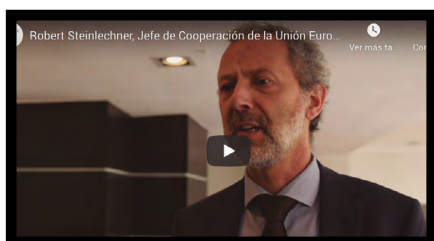
Serie corrupción y género