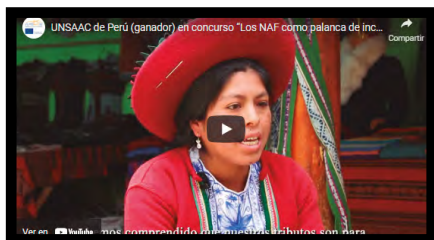
Series "The NAF as a lever for social inclusion in times of Covid", First place in the contest "The NAF as a lever for social inclusion in times of Covid": UNSAAC from Peru