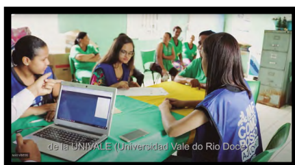
NAF 2.0 'NAF Itinerante'