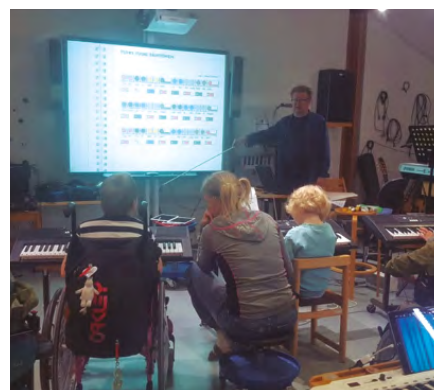
Visit to Finland by an ANEP delegation from Uruguay on inclusive education